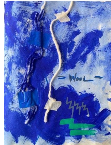
Images above are extracts of “Firouz FarmanFarmaian Cahiers” book-journal presenting the exhibits preliminary research through studies and texts. To be released as a signed Limited Edition version at the occasion of the opening.